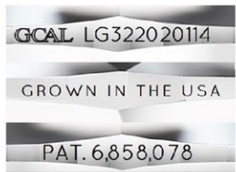
Illustration depicts approx. girdle appearance